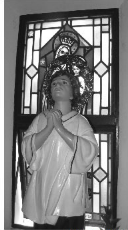
—Church of the Epiphany Image